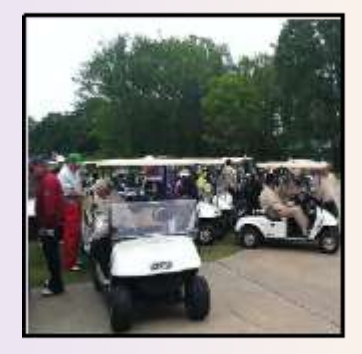
Ready to tee off at the Woodystock Golf Tournament