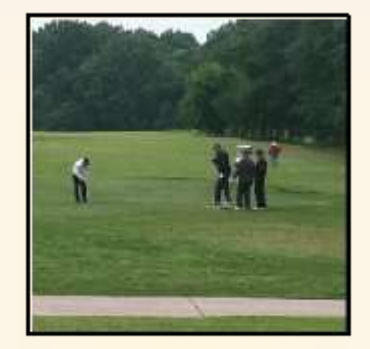
On the green at Black Bear Golf Club Delhi, LA