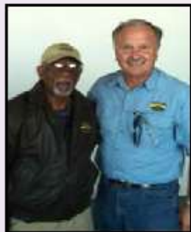
Bo Hunter 50 mission jacket