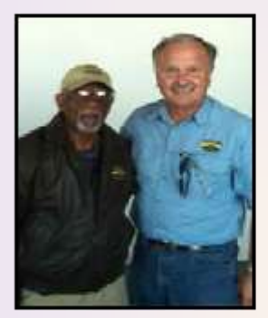
Bo Hunter 50 mission jacket